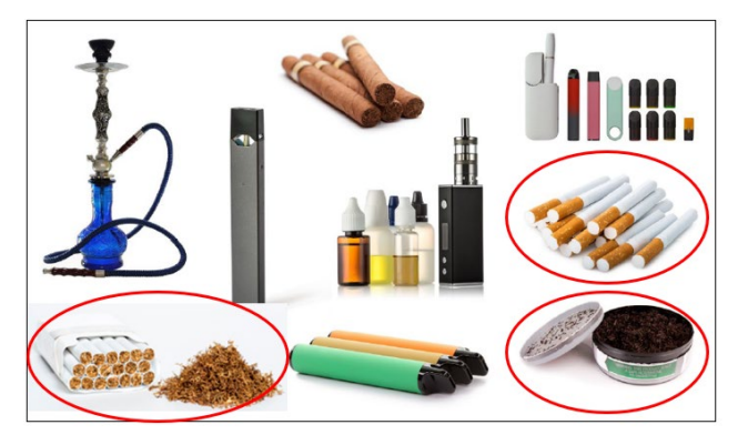
2009 TCA regulated products: cigarettes, smokeless tobacco, cigarette tobacco, roll-your-own tobacco (circled) 2016 Additional deemed products: ENDS<sup>26</sup>, cigars, pipe tobacco, gels, waterpipe tobacco 2022 Products containing nicotine from any source

Figure 3: Tobacco Products Regulated by the FDA<sup>23,24,25</sup>