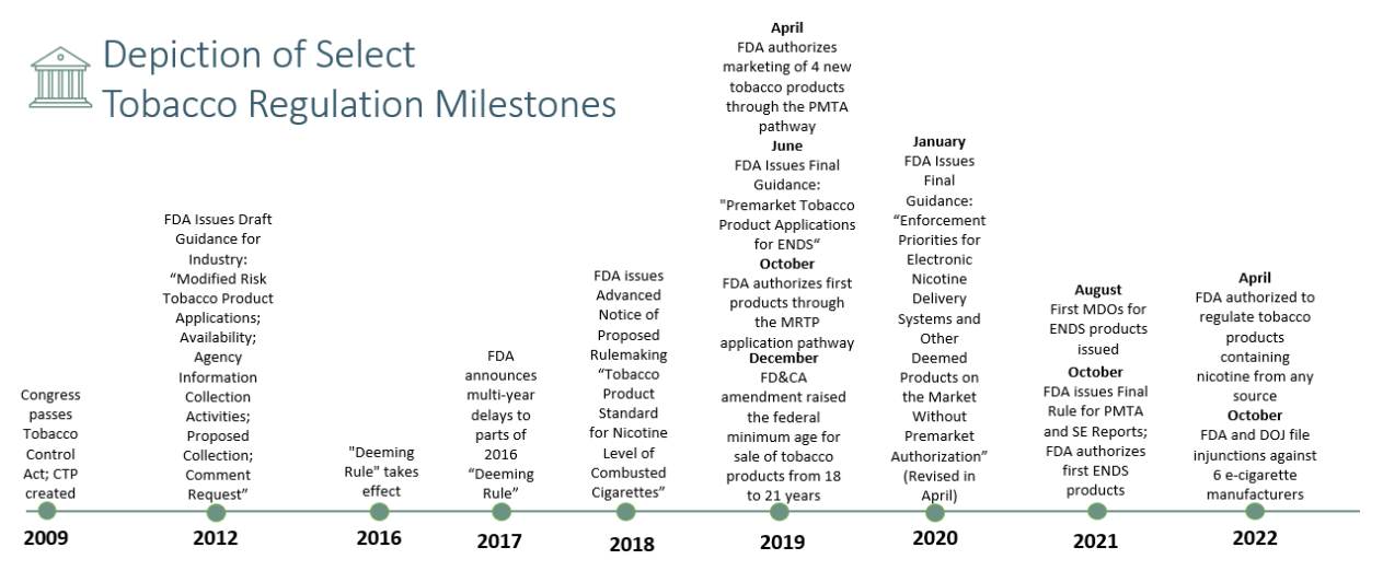
Figure 1: Select Tobacco Regulation Milestones

CTP's stated mission is "to protect Americans from tobacco-related disease and death by regulating the manufacture, distribution, and marketing of tobacco products and by educating the public, especially young people, about tobacco products and the dangers their use poses to themselves and others."<sup>20</sup> CTP describes its work as developing policy, issuing regulations, conducting research, educating Americans on tobacco products, and making decisions on whether new tobacco products and products with modified risk claims can be marketed – including the review and evaluation of applications and claims before the new products are allowed on the market.<sup>21</sup>